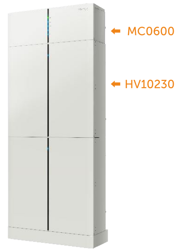
T-BAT H 6.0*